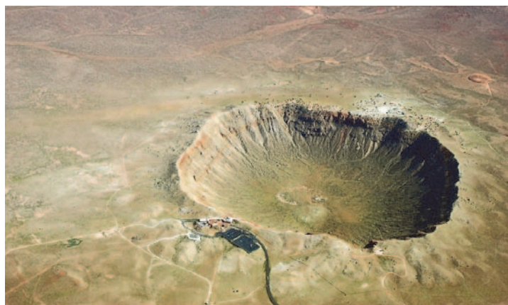
The Barringer Meteorite Crater in Arizona (USA) will be visited during a 3-day post-conference field-trip.

The city of Santa Fe is the state capital of New Mexico. It was founded by Spanish colonists in 1610 and is the oldest state capital city in the USA. It is located at 2,194 m (7,199 feet) above sea level, making it also the highest state capital in the USA. Santa Fe (meaning “holy faith” in Spanish) has a population of 70,000. It experiences a dry steppe climate, with an average temperature in July/August of 25 °C (77 °F), and monthly rainfall of 6.5 cm (2.5”) due to the arrival of the North American monsoon at this time. The city is well-known as a center for arts that reflect the multicultural character of the city: it has been designated as a UNESCO Creative City in Design, Crafts and Folk Art.