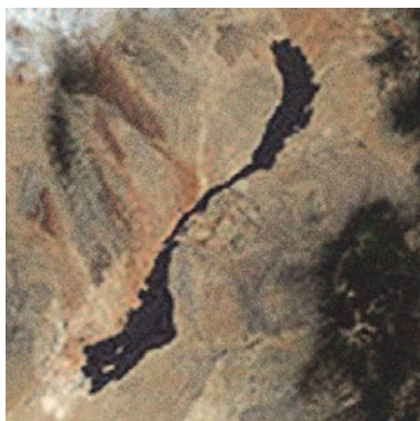
The Carrizozo Malpais lava flow in New Mexico (USA) will be visited during a 2-day post-conference field-trip.

We have reserved blocks of rooms in multiple hotels, offering a range of price categories and distance from the convention center. Most are within walking distance of the center; others offer regular shuttles. One offers apartments of different sizes, making it ideal for families and students.