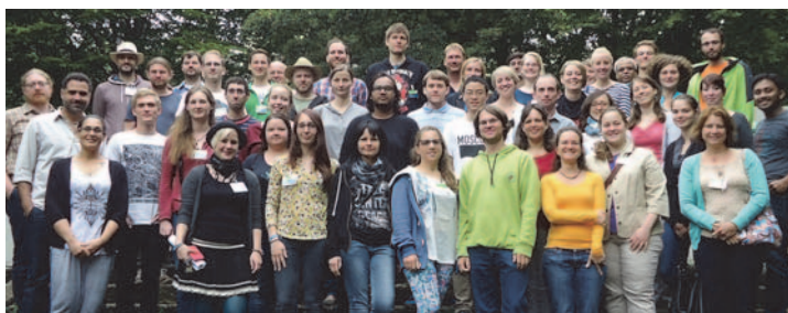
Participants of the Diffusion Modeling workshop in Bochum (Germany)

Between August 24 and August 28, 2015, participants from 11 countries convened at the Institute for Geology, Mineralogy and Geophysics at Ruhr University (Bochum, Germany) to attend a workshop on the application of diffusing modeling to calculate timescales of geologic processes. The workshop was organized by 16 scientists and alumni from the university and the 37 participants ranged from new graduate students to professors.