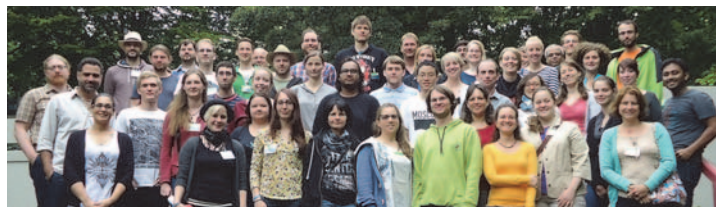
Attendants of the joint MSA DMG shortcourse on diffusion modeling at Bochum

In 2016, DMG will support six short courses. All courses will be aimed primarily at advanced-level undergraduate and graduate students but, as always, are open to more senior researchers as well. Nonlocal student members of DMG will be eligible for travel support to the amount of €50. Further information can be found at www.dmg-home.de/kurse .