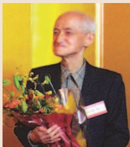
Prof. Akimasa Masuda a few days before his 79 th birthday in October 2010

Undergraduate students are occasionally asked to plot REE concentrations against REE atomic numbers: this usually results in zig-zag patterns that are very inconvenient to discuss or interpret. Unbeknownst to many younger geochemists, it was Akimasa Masuda who was one of the inventors of the method we use today to illustrate REE data: normalizing REE concentrations for rocks, minerals or waters against REE concentrations in chondrites or shale (the latter as an equivalent of average post-Archean upper continental crust). This plotting technique